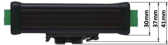
Side view with DIN rail attached